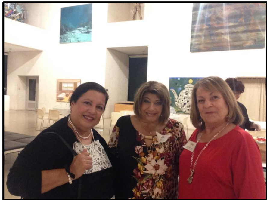
Members enjoying the evening.